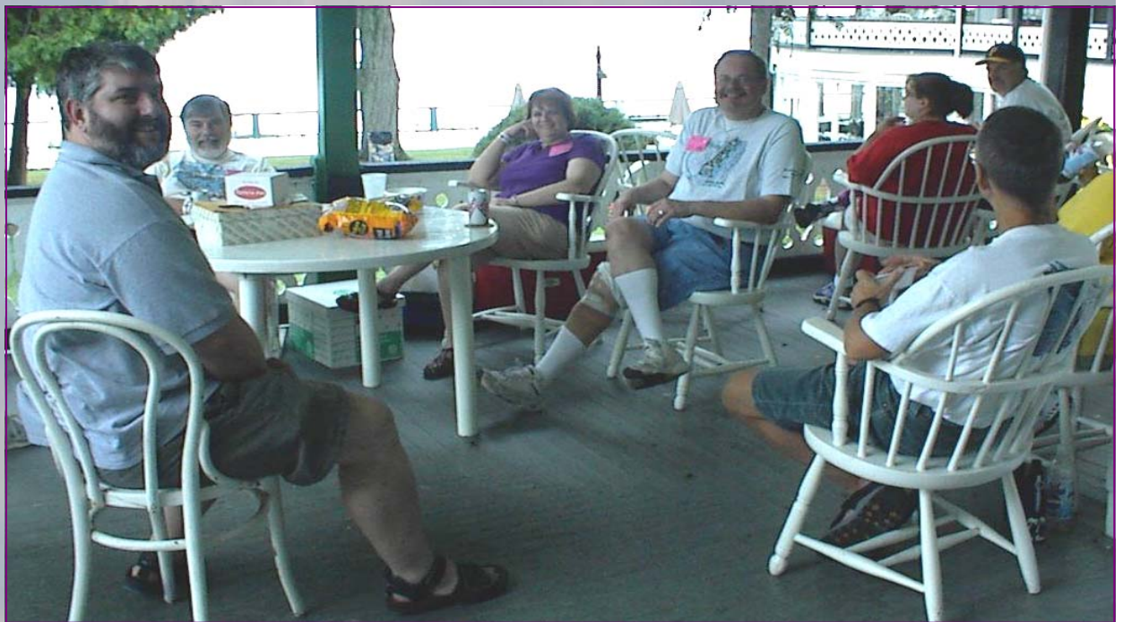
Veranda at Conneaut Lake August 2002